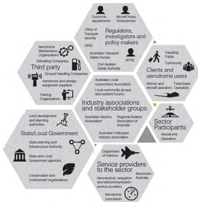
Figure 2: Main stakeholders in the airport sector 7

Most of Australia's major airports are owned by the Commonwealth and are operated on long-term lease by private operators under regulated oversight 5 . Most regional airports are owned and operated by Local Governments, after being divested by the Commonwealth from the 1950s through to the 1990s 6 . Some larger airports are privately owned, and a few are leased from Local Governments recently. Figure 3 provides an overview of the size and distributions of the airports across the country.