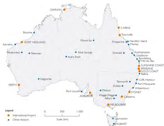
Figure 3: Australia's top 40 airports in 2018-19 by passenger throughput 8